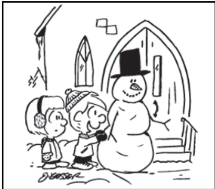
"He's today's greeter."

Sunday Morning Schedule: 8:45 — 9:45 a.m. Contemporary Service 10:00 — 10:50 a.m. Sunday School 11:00 — 12:00 p.m. Traditional Service The Café is open from 9:45-10:45 a.m.